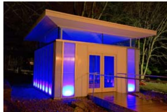
Meditation Room Extreme Home Makeover