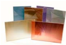
Winter Leaves Series