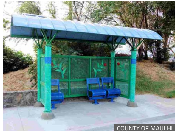
COUNTY OF MAUI HI