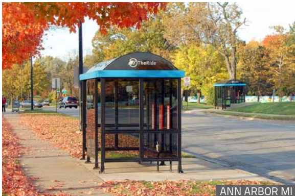
ANN ARBOR MI