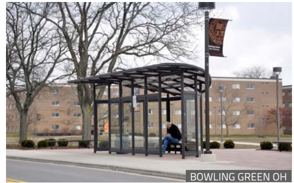
BOWLING GREEN OH