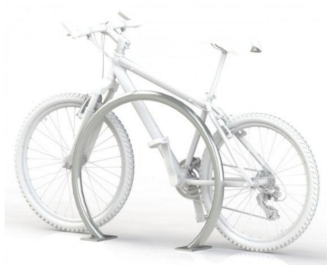
BR00B OM Galvanized / Powder Coated